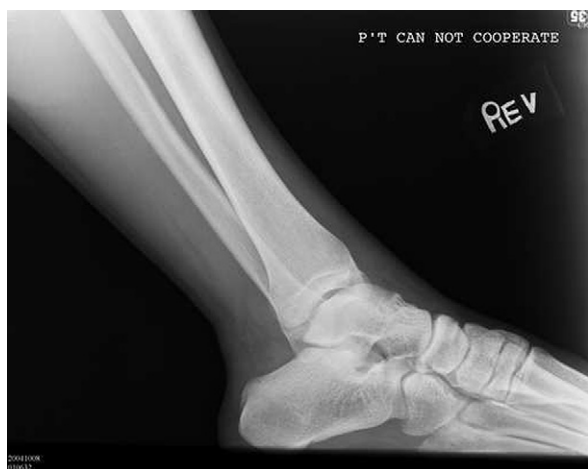
Fig. 2. Lateral view of the right ankle shows dislocation of the ankle.

Conscious sedation with good muscle relaxation was achieved in the ED with 100-mg propofol. Closed reduction of the right ankle was performed first. Longitudinal traction with the right knee flexed was applied. A successful reduction was accomplished without difficulty by applying a posteriorly directed force to the right foot with the ankle stabilized. The left ankle was reduced in a similar fashion (Fig. 5). Then, both hips were reduced by closed manipulation. After reduction, hip stability was excellent, leg lengths were normal, and there was no evidence of postreduction neurovascular compromise (Fig. 6). We applied short leg splints to immobilize the ankles for 30 days. After 2 weeks of