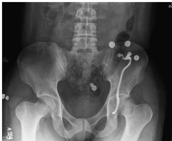
Fig. 1. Anterior-posterior pelvic X-ray. Left femoral head is clearly displaced, and loss of congruity with acetabulum is visible. Incongruence was not apparent at the right hip joint.

maintained (Fig. 1). Pelvic computed tomography (CT) scan revealed posterior dislocation of bilateral hips with no evidence of fracture (Fig. 2). The patient was uncooperative; therefore, only a lateral view X-ray image of the ankles could be obtained. The image showed anterior dislocation of both ankles (Figs. 3 and 4).