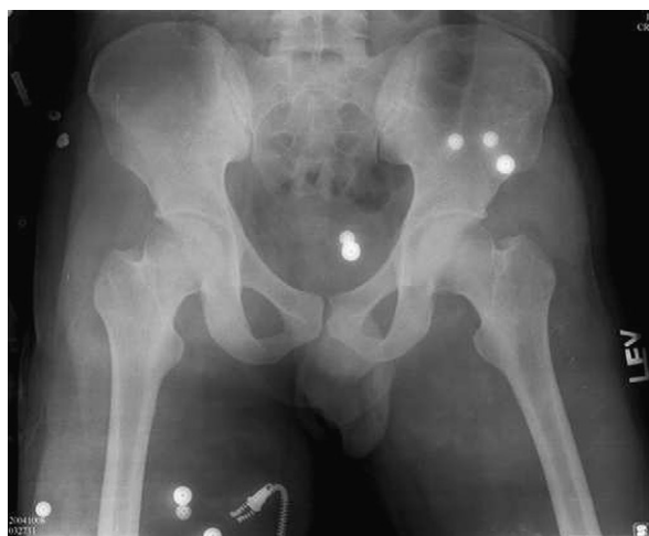
Fig. 6. Anterior-posterior pelvic X-ray (after reduction) shows anatomic reduction of both hips.

The typical mechanism of injury is thought to be sudden deceleration, which usually affects front seat unrestrained passengers in a vehicle, causing injuries to the lower limbs. Depending on the position of the legs at the moment of the crash, the impact may cause anterior or posterior dislocation. 1 Posterior hip dislocation most commonly occurs as a result of a “dashboard injury” and is associated with internal rotation and adduction on the affected leg. Letournel and Judet 10 used vector analysis to explain that the more flexion and adduction the hip is when a longitudinal force is applied through the femur, the more likely a pure dislocation will occur.