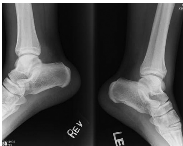
Fig. 5. Lateral view of right and left ankles after reduction.

two bilateral posterior, and one bilateral anterior. Honner and Taylor 6 reported a case of bilateral traumatic anterior hip dislocation and found there are only 10 prior case reports in the English language literature. Four case reports of bilateral asymmetric traumatic hip dislocation have been located in the review by MEDLINE from January 1966 to January 2010. 2,7–9