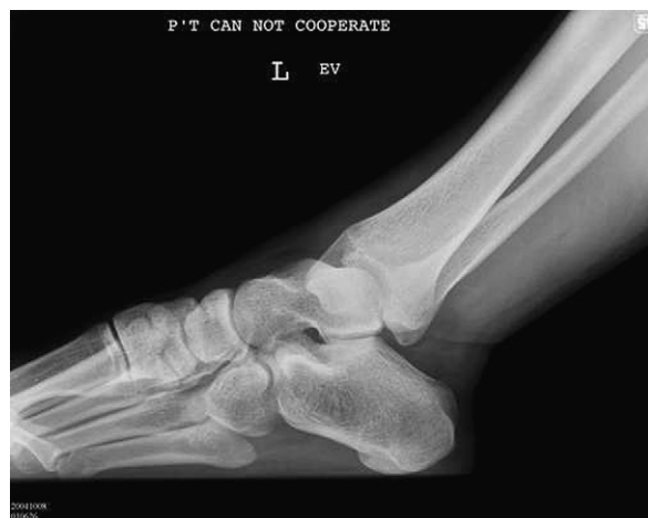
Fig. 3. Lateral view of the left ankle shows dislocation of the ankle.

skin traction, the hips were allowed to move under supervision. The patient was initially mobilized in a wheelchair, and partial weight bearing was allowed at the fourth week. Indomethacin was not prescribed. At 24-month follow-up, the joints appeared normal on radiographs, and there were no signs of avascular necrosis, osteoarthritis, or calcification (Fig. 7).